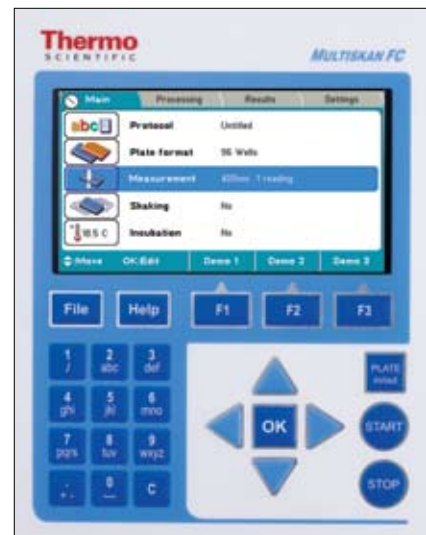
Large color screen and visual internal software

Applications: Immunoassays (ELISA), Protein assays, Endotoxins, Cytotoxicity and proliferation assays, Enzyme assays, Endotoxins, Growth curves